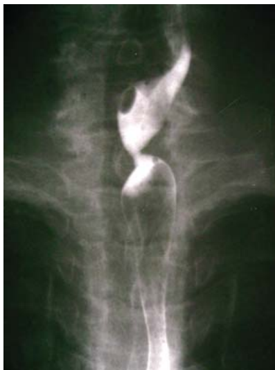
FIGURE 4: Barium esophagography showing stenosis in the upper third of the esophagus

for three consecutive days, with an interval of one week between each of the three cycles administered. There was a significant improvement in the patient's symptoms and in the lesions; therefore, treatment was continued with prednisone at a dose of 1 mg/kg/day on an outpatient basis. Sessions of esophageal dilatation were also provided by the department of gastroenterology and the patient reported a significant improvement in the dysphagia. Treatment was initiated with artificial tears and later followed up by the department of ophthalmology in this same hospital. After two months of follow-up, the patient returned to the clinic complaining that the lesions in the mucosa had deteriorated. At this time, the patient was hospitalized again and the first cycle of intravenous immunoglobulin was initiated at a dose of 1.5 mg/kg, divided over three days. Following treatment, an improvement occurred in her symptoms of dysphagia in the days immediately following pulse therapy. Some of the mucous lesions regressed and no new lesions appeared. The patient was followed up on an outpatient basis for a year during which time she was in use of prednisone 10 mg/day associated with sessions of esophageal dilatation at the gastroenterology department. Eighteen months after diagnosis, the patient died of an undetermined cause that was, however, unrelated to the symptoms of mucous membrane pemphigoid or to corticosteroid therapy.