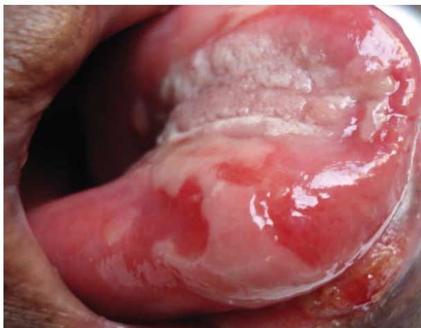
FIGURE 1: Erosions of the mucous membranes of the lip and tongue

and laryngeal mucosa and in the supraglottic region, extending beyond the passage of the endoscope (Figure 4). Indirect laryngoscopy confirmed the presence of edema and ulcerated lesions in the supraglottic region; however, the vocal cords were unaffected. Chest x-ray, colonoscopy, gynecological examination, mammography and ultrasonography of the abdomen and pelvis were also performed and no abnormalities were found. Based on the data obtained at clinical examination and on the supplementary tests, a diagnosis of mucous membrane pemphigoid was made and immunosuppressive therapy with glucocorticoids was implemented cautiously in view of the patient's advanced age. Treatment was carried out with methylprednisolone pulse therapy at a dose of 1 gram/day