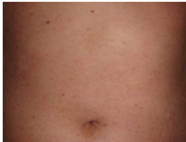
FIGURE 3: Five days after the resolution of the pulmonary condition there was complete resolution of the pustular lesions