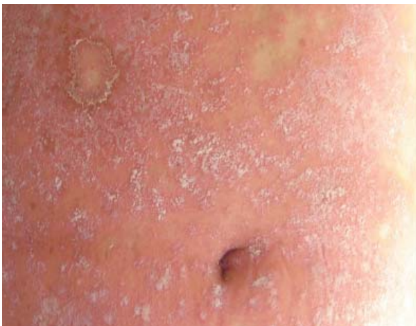
FIGURE 1: Generalized pustular psoriasis. Abdominal pustules are noted

It was reported here the case of a patient with