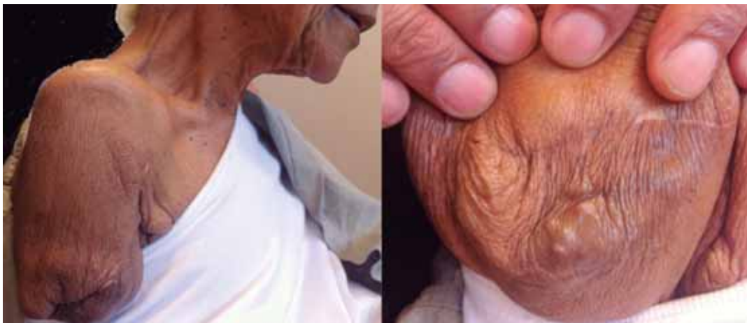
FIGURE 2: Local recurrence of lesions in the base of the amputated arm

After 3 months there was a local recurrence of lesions in the base of the amputated arm, and a new surgical approach was programmed (Figure 2).