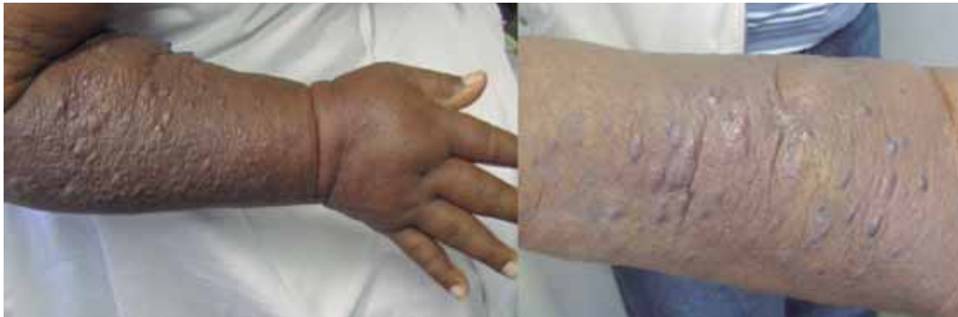
FIGURE 1: Multiple papules and erythematous-violet nodules on chronic lymphedema in the right upper limb