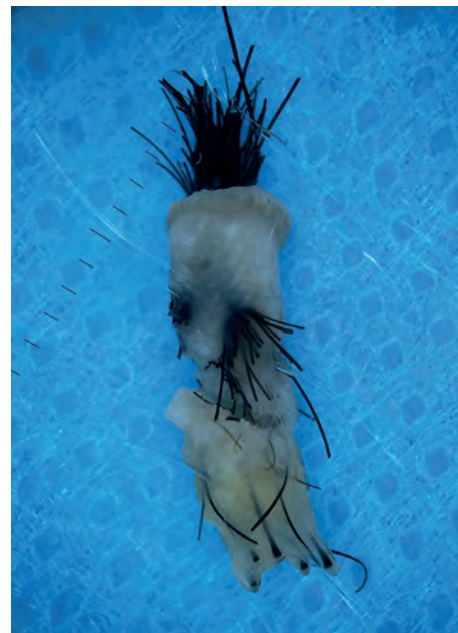
FIGURE 3: Dermoscopic image of a tuft showing retained hairs within the involved follicular units