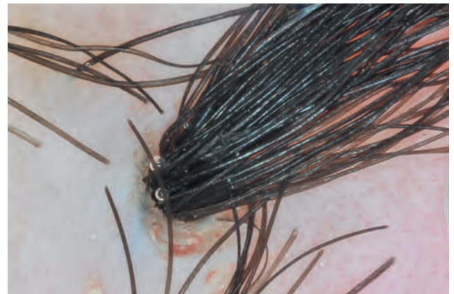
FIGURE 2: Dermoscopy shows multiple hairs emerging from the same follicular orifice