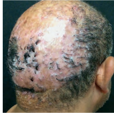
FIGURE 1: Extensive areas of cicatricial alopecia with polytrichia

TF is caused by clustering of adjacent follicular units due to a fibrosing process that happens when the infundibular epithelia of damaged follicles heal leading to the formation of a common infundibulum. Telogen hairs can not detach and stay retained within the involved follicular units. 2 Several diseases have been described as