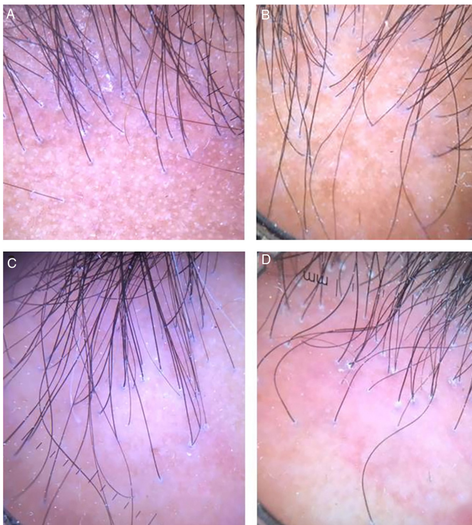
Figure 2 Tricoscopy of the frontal implantation region of patients a, b, e, f, showing absence of vellus and erythema and perifollicular desquamation in all cases, and interfollicular desquamation in C and D.

biopsy. As a differential diagnosis, it could be considered atrophic pilar keratosis, but none of them presented pilar keratosis.