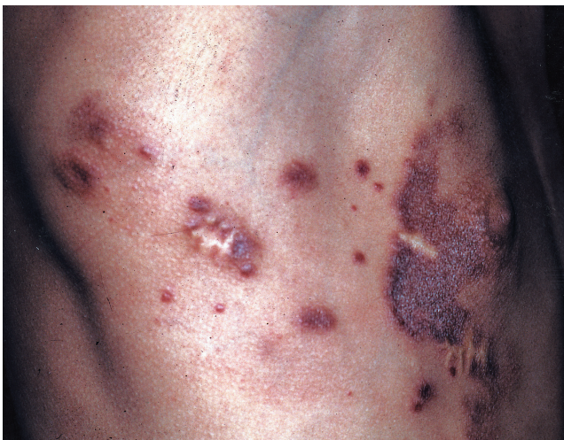
FIGURE 1: Tufted hemangioma on right breast, extending to dorsum

Based on the literature and on the vascular nature of the pathology, the choice was made for the attempt of treatment with laser. Initially a test with NdYAG long pulse laser (Vasculight®/Lumenis, 1064nm of wavelength) was carried out, with a fluence of 90J and pulse duration of 100 ms, with no response. Later, pulsed-dye laser was attempted (Candela-VBEAM FLPDL, with 585 to 595nm of wavelength). Patient was submitted to four sessions, in which large areas were treated, with the fluence ranging from 8,0 to 9,0J/cm 2 , a spot of 7mm, and pulse duration time ranging from 0,45 to 3ms. Interval between sessions was 45 days. During laser application, the patient complained of pain, despite use of topic local anesthetic (lidocaine and prilocaine). Lesion