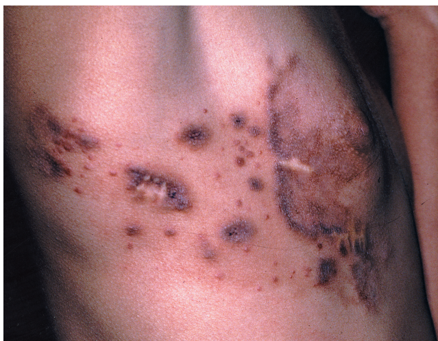
FIGURE 3: Lesion after treatment with pulsed-dye laser. Initial reduction on right breast and appearing of new papules

Pulsed-dye laser promotes selective vascular destruction with minimal aggression to surrounding skin. Thus, capillary tufts in these case could serve as a target for the laser. 11 Even though this is a rare disease, five cases of treatment with pulsed-dye laser for tufted hemangioma have been described, with variable results – in two of them with good response, 11,12 and with complete failure in three others. 1,13,14 Yet, because it is a relatively safe method, with few side effects, the main being post-inflammatory hyperpig-