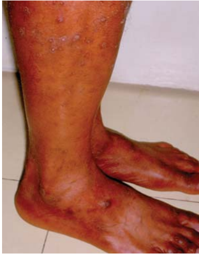
FIGURE 8: Allergic contact dermatitis caused by chrome and rubber present in the IPE of a chrome worker