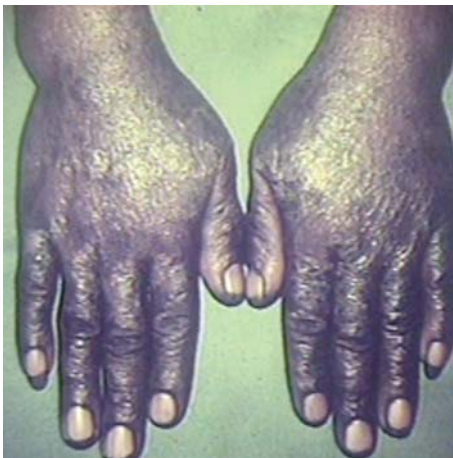
FIGURE 1: Relative contact dermatitis by primary irritant caused by solvents in a gas station worker