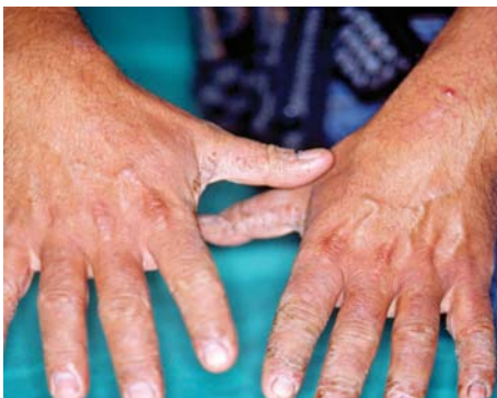
FIGURE 10: Allergic contact dermatitis caused by cutting fluids

In the cleaning sector, tests are performed with solutions diluted at 1% or 2% to avoid the irritant effect. In the metallurgical sector, PTs with new oils may yield negative results and tests with previously used oils, containing preservative additives (corrosion inhibitors and antimicrobial) may yield positive results. Both new and previously used oils can cause irritation. Patch tests with food applied to healthy skin can be negative.