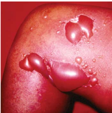
FIGURE 2: Absolute irritative contact dermatitis caused by sodium hydroxide in a maid

It occurs more rarely. The more frequent ones are: dishydrosis (metals, cutting oils); lichenoid contact dermatitis (photo developing solution, epoxy resins, Ni, and Cu); non-immunologic and immunologic contact urticaria (mediated by IgE), which occur minutes after contact (latex, food, plants, medicine, preservatives, fragrances) 26 ; chemical vitiligo – contact leukoderma (hydroquinone); purpuric contact eruption (rubber products and laundry bleachers); polymorphous erythema – contact simile (plants, wood, drugs, and pesticides); pustular eruption (metals and ointments); keratosis contact dermatitis (ACD caused by rubber); post-eczematous or non-post-eczematous hyperchromic CD (creams, oil preservatives, perfumes, colorings, wood, laundry detergents, and lime). 23