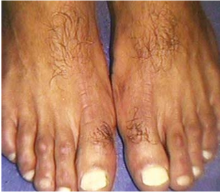
FIGURE 6: Occupational leukonychia caused by metha-hemoglobinemia in textile dyes