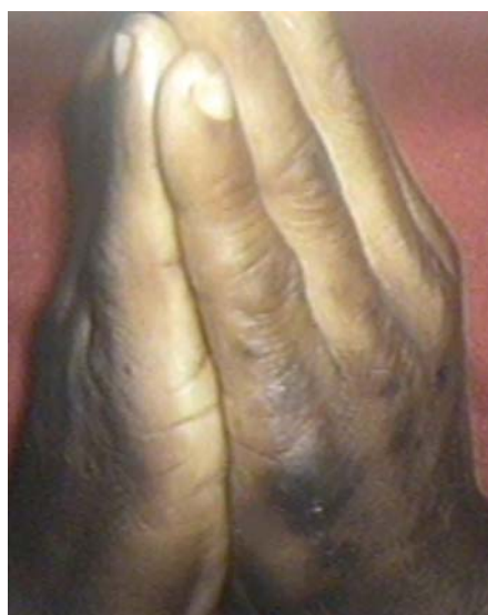
FIGURE 4: Callosity in the lateral region of the right hand of a car-wax- ing worker