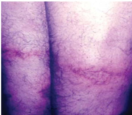
FIGURE 7: Absolute irritative contact dermatitis caused by wet cement ("cement ulcerations")

Allergic contact dermatitis affects nearly 50% of hairdressers; assistants and apprentices more often show ICD due to the humidity present in their work environment. Since hairdressers perform several activities, these professionals enter in contact with many products and the greatest risks are irritative agents: shampoos, hydrogen peroxide, ammonium persulfate, which accelerates hair discoloration, materials with increased humidity, hot air, and gloves. 37 The most sensitizing substances are: metals (Ni and Co); p-phenylenediamine present in hair dyes and henna tattoos; sodium thioglycolate of products used in hair waving and straightening; rubber latex and vulcanizers used in rubber gloves; fragrances, creams with preservatives (formaldehyde); nail polish, nail prosthesis and acrylic glue, cosmetics (metildibromo glutaronitrile) 38,39