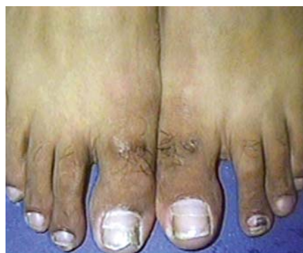
FIGURE 5: Foreign body granuloma caused by animal hair fragments in hair shearer (pilous fistula)

las (hyperchromia, hypochromia, and scars), performance decline and professional disability. Pre-cancerous keratosis and occupational cancers show complications specific to the malignancy of each histological type, mainly ulcerations, bleedings and metastization. Occupational infections may present complications typical of each agent's pathogenicity and localization.