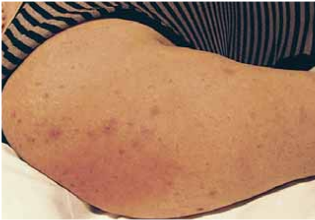
FIGURE 1: Ulcerated erythematous papules on the lateral aspect of the right arm suggestive of scratching

The patient was treated with methylprednisolone aceponate cream 0.1% and oral hydroxyzine 25mg every 8 hours, which resulted in little improvement of the pruritus. Consequently, gabapentin was introduced at 900 mg/ day, achieving optimal control after 3 months of follow-up. The patient was also referred to neurosurgery and oncology consultation for additional therapeutic orientation.