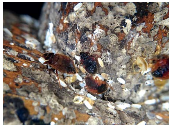
FIGURE 5: Presence of Cimicidae eggs, nymphs, adult insects and feces over the patient's bed - case 2

sequence, in the "breakfast, lunch and dinner" pattern (Figure 4). In an initial examination were raised hypotheses of bites by bed bugs or fleas.