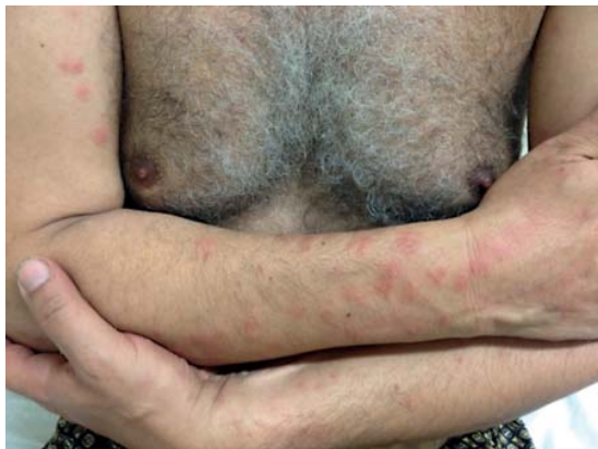
FIGURE 3: Erythematous edematous lesions on upper limbs