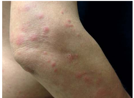
FIGURE 4: Erythematous papules, some with the peculiar "breakfast, lunch and dinner" pattern