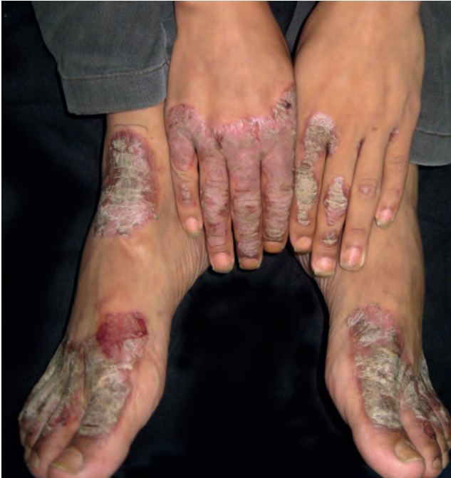
FIGURE 1: Well-demarcated hyperkeratotic erythematous to violaceous scaly plaques symmetrically involving both the dorsal surface of hands and feet, predominantly on the fingers and toes. Erosion and fissures noted on the surface

were planned accordingly, but patient was lost to follow-up with no information about treatment and prognosis.