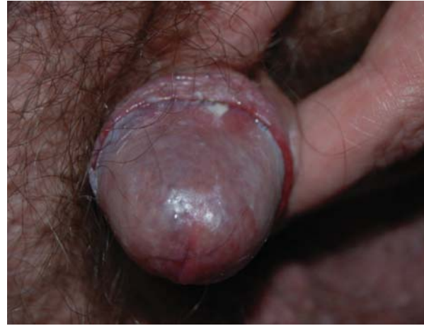
FIGURE 5: Case 2 after treatment: remission of the lesion 8 weeks after commencing treatment

The condition is relatively common in elderly men and presents clinically as well-demarcated, erythematous, shiny plaques on the glans, coronal sulcus or the inner surface of the foreskin. 4