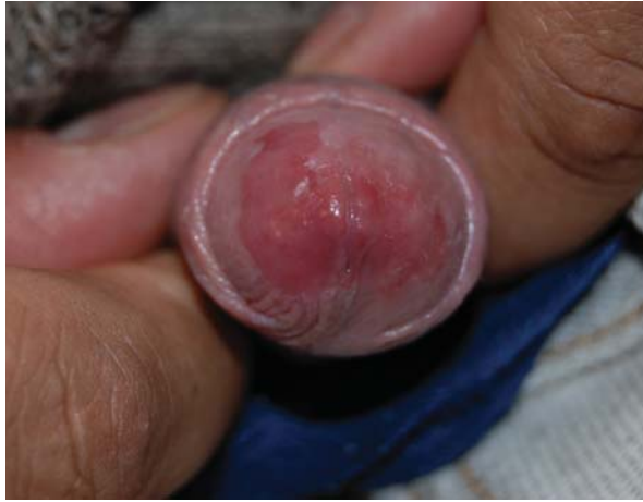
FIGURE 4: Case 2 before treatment: erythematous plaque of the glans before treatment