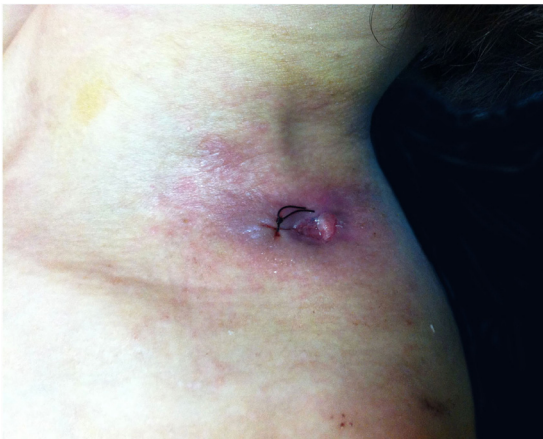
Figure 1 Ulcer on the left shoulder. The cutaneous ulcer on her left shoulder, after a skin biopsy.