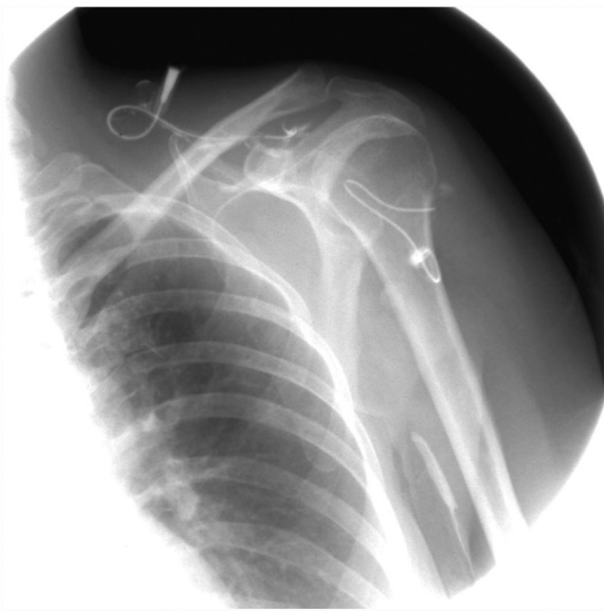
Figure 2 Irregular subcutaneous sinus tracts. A sinogram illustrating irregular sinus tracts extending from the cutaneous ulcers.