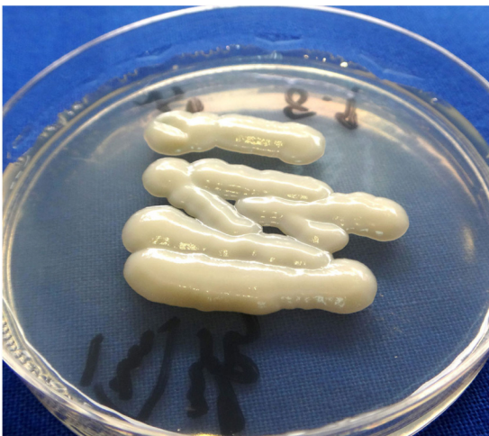
Figure 3 The cultured microorganism. Shiny, light-yellow mucoid colonies on Sabouraud's dextrose agar.