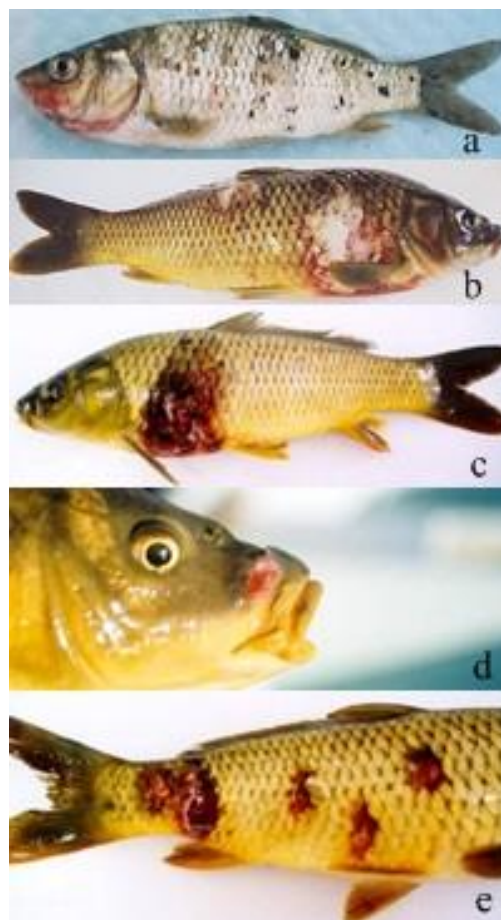
Figure 1. Morphological symptoms of motile aeromonad septicemia (MAS) in C. carpio (a-e).

Dermal ulcers were observed on the underside of the eye in some fish (Figure 2a). In advanced stages of the infection, it was detected that dermal necrosis turned into muscle necrosis and it reached vertebrae by deepening (Figure 2b). In some fish, anal fin branched rays were completely degenerated, whereas caudal fin branched rays were partially degenerated (Figure 2c). Exophthalmus was detected in the eyes of the many fish (Figure 2d). At the last stage of the aeromonad septicemia, it was observed that the abdomen of the fish was swollen (Figure 2e). After an examination, a purulent liquid was found in the abdominal cavity.