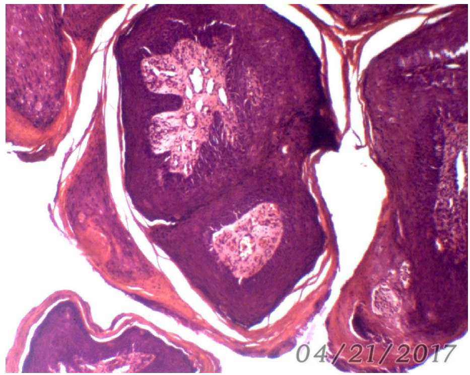
Figure 2. Histological structure of papillomas. Coloration of hematoxylin eosin.

It is quite reasonable in our case to use complex therapy with the use of specific etiotropic (antiviral) and local remedies. This does not reduce the effectiveness of the vaccine, but does not allow us to track its therapeutic effect, so we limited ourselves to its use. As the practical experience shows, the absence of specific biological drugs, including papillomatosis, promotes the preservation of the pathogen in latent infected animals, with the subsequent development of all new clinical cases or epizootics of papillomatosis.