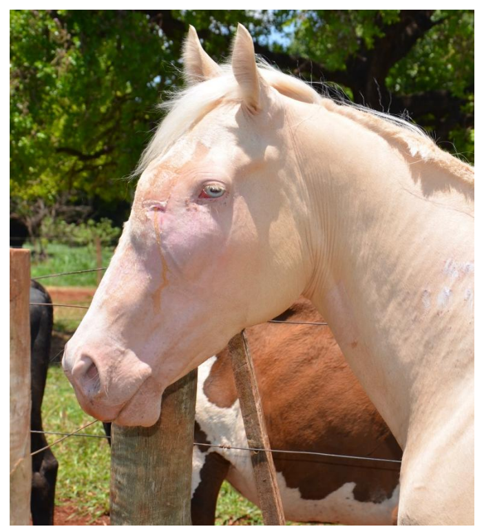
Figure 1. Multilobular osseous tumor in the left nasal cavity and paranasal sinuses of a mare. It is hard and markedly enlarged, affecting the left nasal, frontal, and maxillary bones.

During physical evaluation, the animal was alert; it was in good body condition and showed a marked facial asymmetry secondary to a volume increase affecting the nasal, frontal, and maxillary left bones (Fig. 1). Furthermore, the showed inspiratory patient dyspnoea, mucopurulent nasal discharge, and no air flux in the left nostril; exophthalmia and epiphora in the left eye; hyperaemic ocular mucous membranes; tachycardia (58 beats/minute); and tachypnoea movements/minute). (24 The remaining parameters were normal, no teeth and abnormalities were found. Additionally, it was observed that when the horse was eating, there were cough episodes.