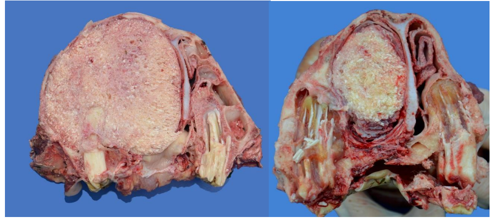
Figure 4-5. Multilobular osseous tumor in the left nasal cavity and paranasal sinuses of a mare. The left nasal cavity is effaced by a spherical, yellowish mass, with a granular aspect that displaces the nasal septum into the right nasal cavity. The mass surrounds the molar teeth, and the nasal turbinate are missing.