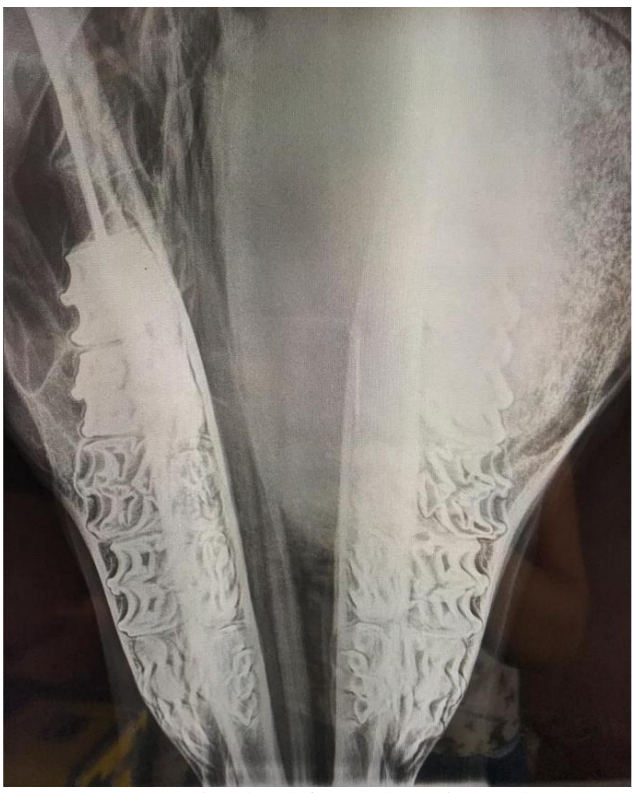
Figure 2. Multilobular osseous tumor in the left nasal cavity and paranasal sinuses of a mare. Radiographic image showing dorsoventral projection. A spherical, osseous, radiopaque mass affecting the left frontal, maxillary, and nasal bones and showing osteolysis and osseous proliferation can be observed.

histological evaluation. Histologically, the sample consisted only of superficial layers of the nasal mucosa, which was unaffected.