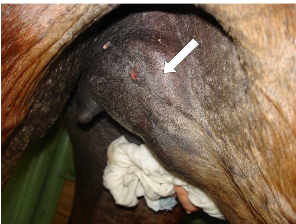
Figure 1. Mammary gland of the mare 1. Note the irregular area present in the inspection of right MG (arrow), corresponding to firm mass with floating areas identified on palpation.

On clinical examination, there were no changes in vital parameters, haematological evaluation or total thyroxine (T4), although the total T4 dosage does not adequately reflect the thyroid hormone profile in the animal. The right MG of Mare 1 (M1) had a firm mass of approximately 20cm, with areas of fluctuation (Figure 1). Mare 2 (M2) had a firm homogeneous enlargement of the left MG without nodules, accompanied by cranial edema, increased temperature and mild sensitivity.