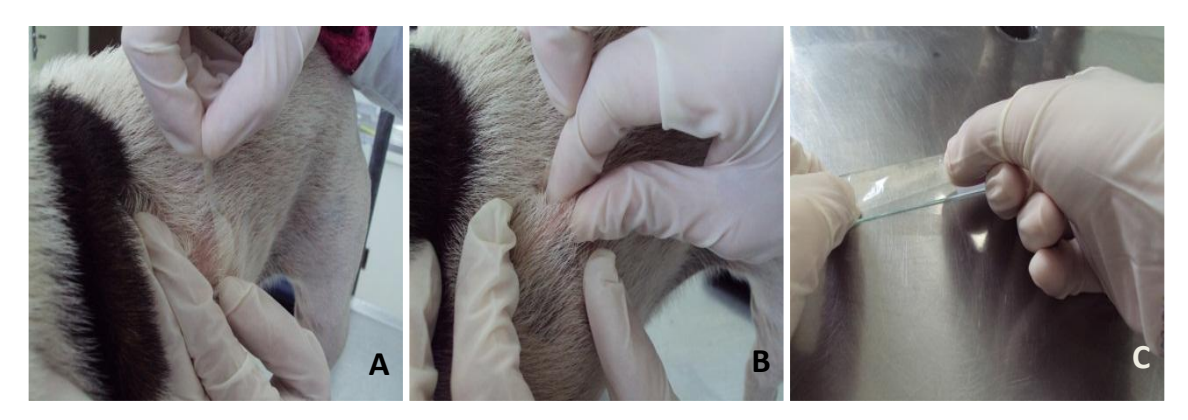
Figure 1. Acetate tape skin impression technique: (A) The acetate tape is placed on the selected lesion site; (B) skin submitted to pressure under the tape (C) tape placed on a glass slide.