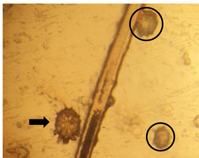
Figure 3. Adult (arrow) and immature (circle) forms of S. scabiei visualized under the microscope from samples obtained from a bull terrier using impression of the skin with an acetate tape. Magnification 400x.