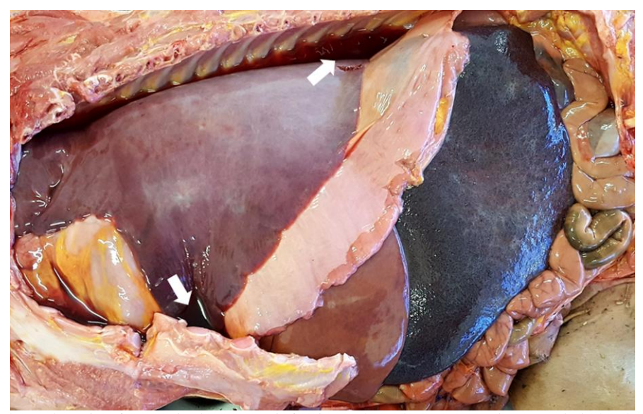
Figure 1. Aborted equine fetus, Theileria equi infection. The subcutaneous tissue and skeletal muscles are markedly pale, and there is severe splenomegaly and moderate hydrothorax (white arrow).

Necropsy was performed five hours after the abortion. Grossly, the subcutaneous tissue, skeletal muscles and visible mucosae of the aborted fetus were diffusely pale. Pallor was also observed diffusely at heart and liver. There were also mild hydroperitoneum, moderate hydrothorax, and marked splenomegaly (Figure 1) with a prominent white pulp. Samples of thymus, heart, lung, liver, spleen, kidney, brain, and placenta were collected at necropsy and fixed in 10% buffered formalin for histopathology. Sections were stained with hematoxylin-eosin and Giemsa.