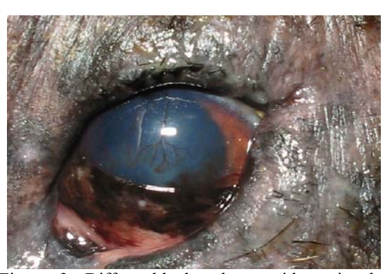
Figure 2. Diffuse blepharedema with periocular alopecia, seborrheic dry exudate and thicknening fibrotic eyelids, keratitis with corneal edema, pigmentation and neovascularization in a dog with visceral leishmaniasis, Pernambuco State, Brazil, 2004.