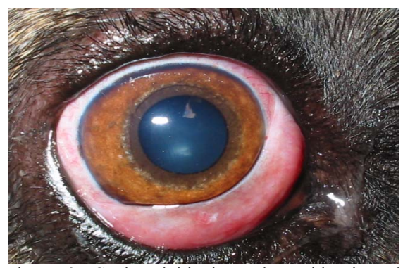
leishmaniasis. Note the prominent thickening of the visceral ventral bulbar conjuctiva, Pernambuco State, Brazil, 2004.