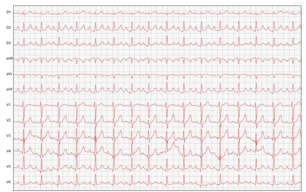
Figure 1. 12-lead electrocardiographic tracing showing sinus tachycardia (170bpm), increased P wave duration (50ms) and T wave showing amplitude greater than 25% of the QRS complex amplitude, in lead DII. Speed 50mm/s, 10mm/mV, (N).