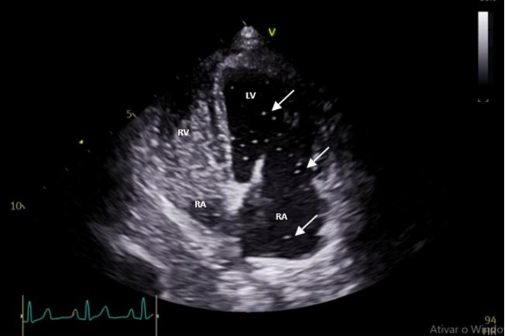
Figure 4. Echocardiographic image obtained in apical four-chamber view, after applying agitated saline solution. Note the contrast-filled right atrium and ventricle and the presence of hyperechogenic points in the left atrium and ventricle (arrows), characterizing the passage of contrast due to a right-left shunt through a patent foramen ovale.

LV: left ventricle; RV: right ventricle; LA: left atrium; RA: right atrium