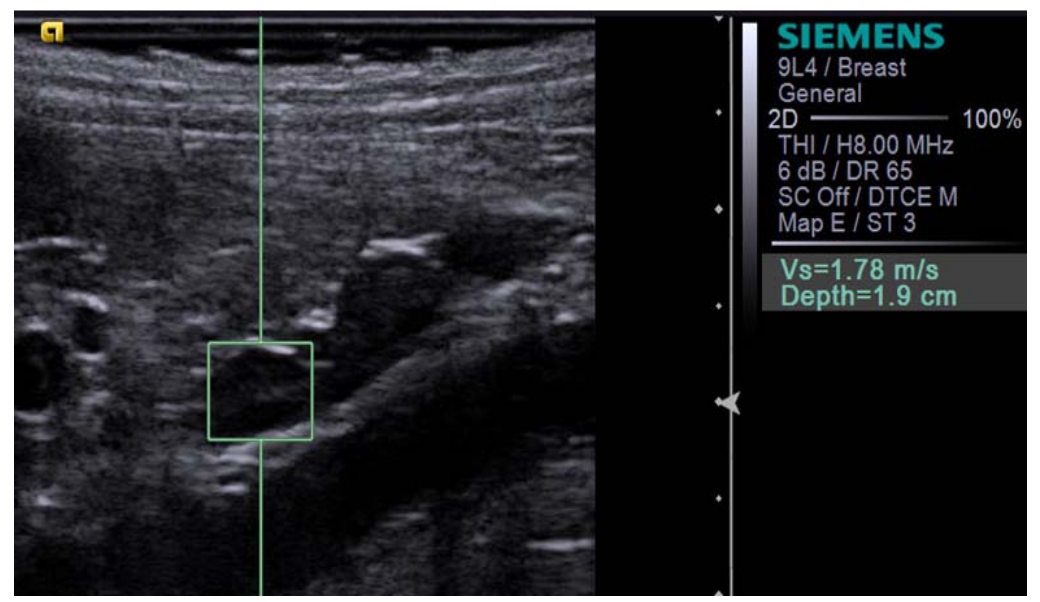
Figure 2. Ultrasound image of a canine adrenal during its quantitative ARFI evaluation with presence of calipter in cranial region and to obtain of the shear velocity.

cranial pole, 1.74 m/s (95% confidence interval: 1.23 - 2.25 m/s) for body region and 1.63 m/s (95% confidence interval: 1.34 - 1.91 m/s) for caudal pole. There was no significant difference between sheer velocity values from left and right adrenal glands and their evaluated portions in relation to the sheer velocity (P = 0.3087).