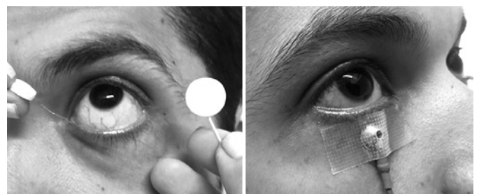
Figure 1. Electrode placement (microfiber electrode/skin electrode).

The reduction found in peak-to-peak amplitudes recorded with skin electrodes in our study is consistent with previous reports of reductions of 75% and 80% (9) , 43%-73% (10) , 50%-70% (11) , 50% (12) , 23%-62% (13) , and 42%-57% (14) . Our data showed reductions between 46% and 62% on the peak-to-peak amplitudes. Physical factors are involved in this reduction given their influence on the current flow through the electrodes. Such factors include the resistive and capacitative characteristics of the materials from which the electrodes are made and coated with and the area of the recording surface. In addition, the amplitude recorded with skin electrodes is noisier, mainly as a result of electromyographic activity intervention (15) . However, it has been shown that even with reduced amplitudes, recordings with skin electrodes can be useful to differentiate between normal and abnormal responses, as long as an appropriate normative reference is used (16) . The combination of clinical