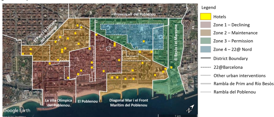
Figure 5 - Special Urban Plan for Tourist Accommodation and the location of hotels