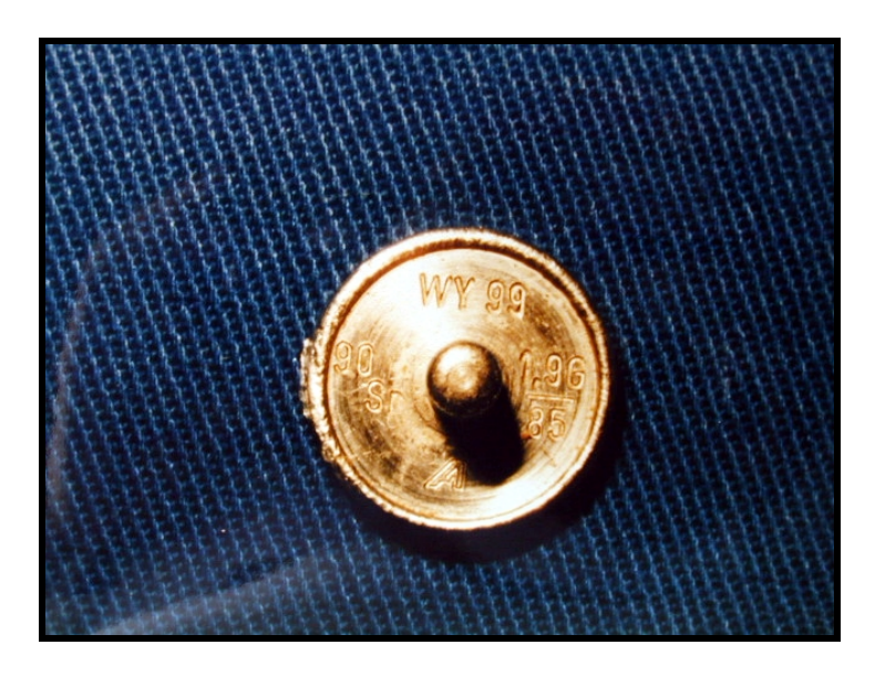
FIGURE 4 – Photograph showing the Strontium-90 plate used to emit beta radiation.

24 hours after surgery, the animals were again anesthetized in a bell-jar with ethyl ether vapor and were given their first dose of radiation. For this we used a Strontium-90 plate with a diameter of 1.5 cm and activity of 50 mci<sup>1</sup>, as measured in October 1985, and a penetration power of 1.54 million electron volts (FIGURE 4).