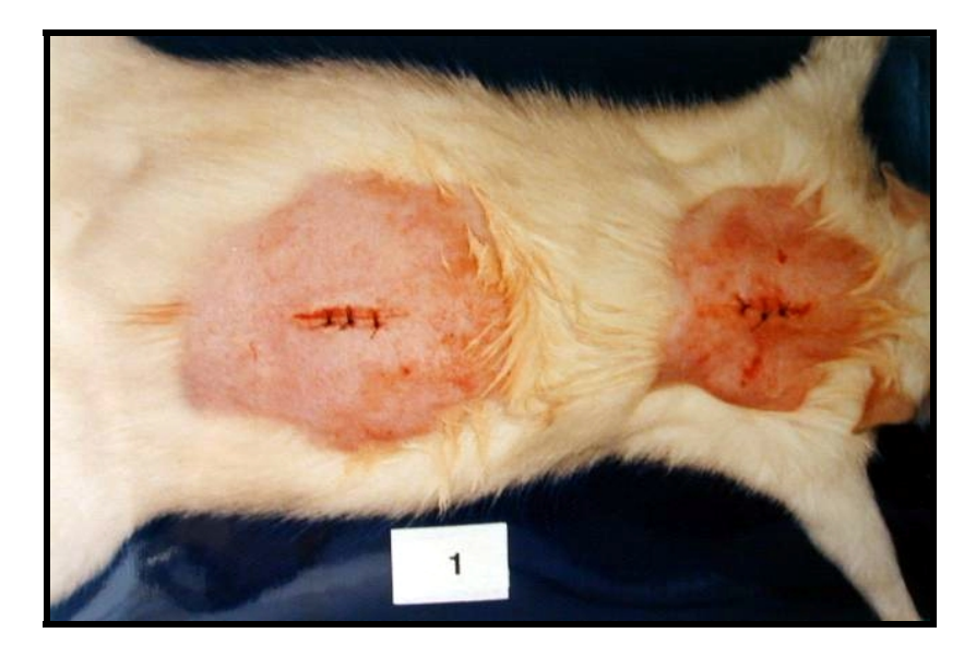
FIGURE 3 – Photograph of rat, showing the two sutured wounds.