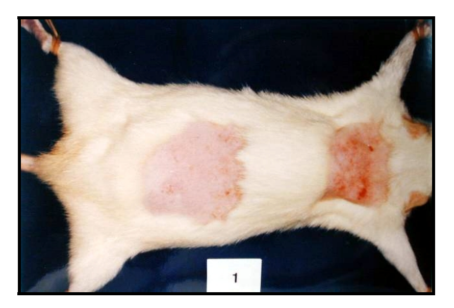
FIGURE 1 – Photograph of a rat, showing the two circular areas on the dorsal region where the fur was removed.

Two circular areas with a diameter of 2.5 cm each had the fur manually removed. Both were on the animal's dorsal region: one near the skull, where the radiation would be applied, and the other one near the tail, for control purposes (FIGURE 1).