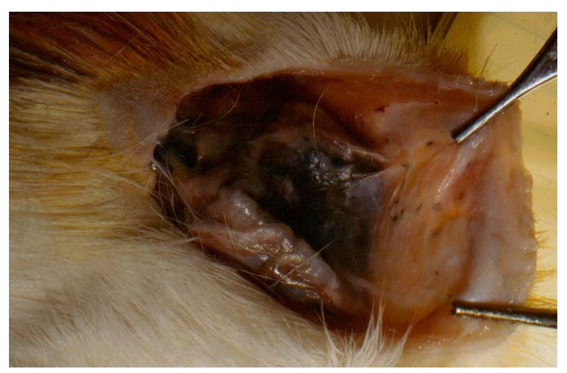
FIGURE 8 - Methylene blue, when injected through the irrigation system, stained the tissue expander's capsule.

With the purpose of testing the efficacy of the irrigation system, methilene blue was injected into the capsule after the complete expansion of the prosthesis. After the animal's sacrifice, the capsule was dissected and it was found that the stain spread throughout the capsule. (FIGURE 8 e 9).