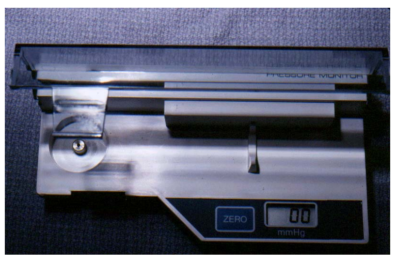
FIGURE 6 - Electronic manometer device.

After each expansion the pressure was measured with a Striker electronic manometer device (FIGURE 6 and 7).