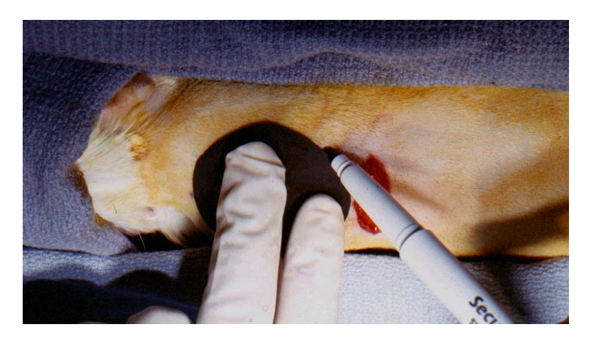
FIGURE 2 - Pattern used to standardize the area of subcutaneous dissection.