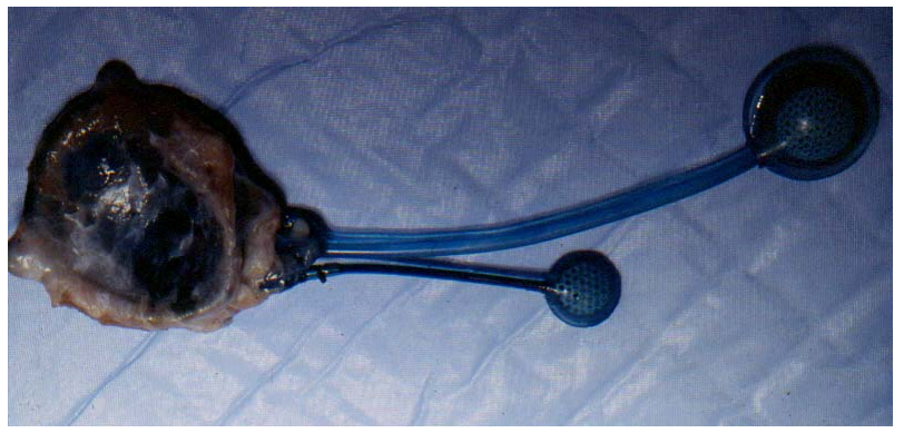
FIGURE 9 - Removal of the expander and the irrigation system with the capsule, showing the whole capsule's surface stained with methylene blue.