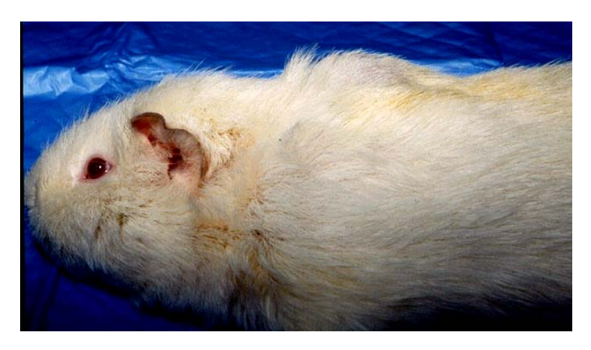
FIGURE 5 - The expander is completely filled with saline solution (20 cc). A bulging can be seen on the dorsum of the animal.

The prosthesis was expanded at surgery, in both groups of animals with a saline solution corresponding to a volume of 20% of its total capacity. Starting from the first week of surgery, at every four days, the prosthesis was filled with a volume corresponding to 10% of the expander's capacity, until the whole expander was filled -20 cc (FIGURE 5).