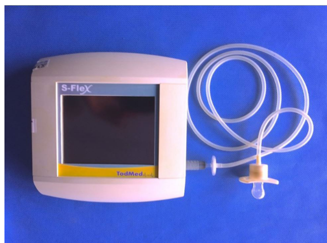
Figure 1. The S-FLEX® equipment

The S-FLEX® (Figure 1) is manufactured by the TODMED company (Blumenau, SC). It registers the non-nutritive sucking pressure of newborns and provides both numeral and graphical output. It contains a pacifier with an orifice at one of its extremities, attached to a concave anatomical ring and a pressure sensor. The pacifier is connected to the equipment by a 1.5m extension tube with a 1.25mm diameter. The S-FLEX® can be attached to different types of pacifier. The one used in the present study was a size 1 orthodontic silicone pacifier, extracted from the oral fit model from the NUK® brand, and recommended for breastfeeding infants aged 0 to 6 months. A small hole was made on the tip of the pacifier using a 1014 diamond bur (KGS). The physical characteristics of the