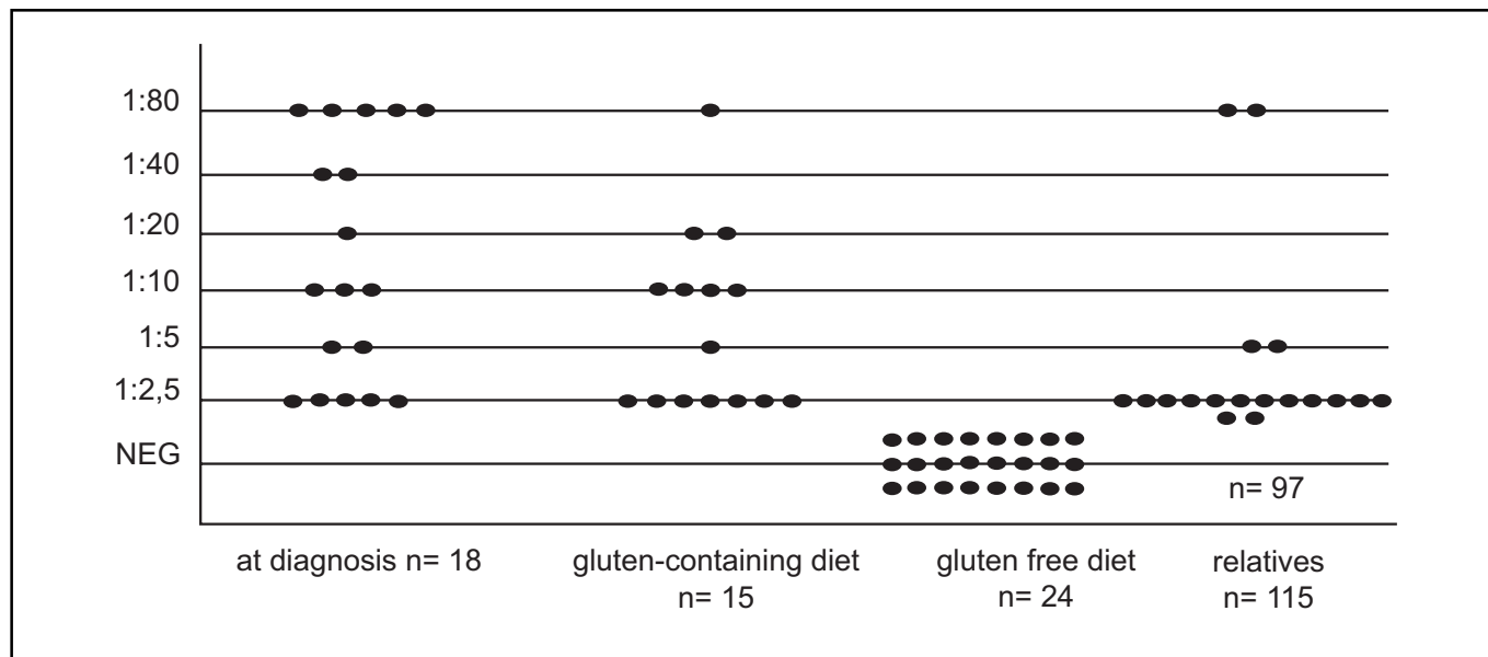
FIGURE 1 – EmA IgA titers in celiac patients and their relatives

Of the 115 first-degree relatives of celiac patients (Group III) 18 (15.65%) were positive, showing statistical significance in relation to the control population ( P < 0.0001 ) (Fig. 2). EmA IgA titers ranged from 1:2.5 to 1:80 in this group (Fig. 1). Among the positive relatives there were seven mothers (38.88%), four fathers (22.22%), four children (22.22%) and three siblings (16.66%). The female sex predominated. Only seven relatives agreed to an intestinal biopsy (Table 3): one (EmA IgA 1/80) presented total villous atrophy; one (EmA IgA 1/5) and five (EmA IgA 1/2.5) showed preserved intestinal architecture but presented an increased number of intra-epithelial lymphocytes (mean number, 36%). The normal number reported for a healthy Brazilian population from