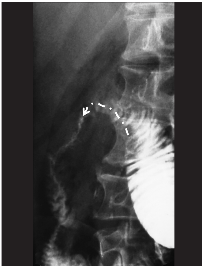
FIGURE 1. Contrasted radiography showing duodenojejunal anastomosis

The study of the contrasted radiographies of the esophagus-duodenum-jejunum showed the adequate transit of the contrast means through the esophagus and esophagojejunal anastomosis in 100% of the patients (Figure 1).