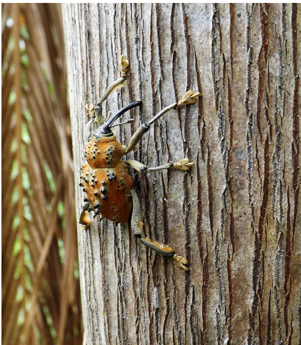
Figure 1. Adult of Ozopherus muricatus Pascoe, 1872 (Coleoptera: Curculionidae) on açai palm, in the municipality of Buritit, Rondônia, Brazil.

The large commercial growth of açai has generated an expansion of cultivated areas, with a consequent increase in the incidence of pests in these plantations, causing significant economic harm to its development and production (SOUZA, 2002). The weevil Ozopherus muricatus Pascoe, 1872 (Coleoptera: Curculionidae) (Fig. 1) is an endemic species in the Amazon region, and has gained great visibility due to its deleterious effects on açai palm cultivation, causing up to 42% of loss of fruit bunches and becoming a pest with the potential to cause major damage (TREVISAN; OLIVEIRA, 2012).