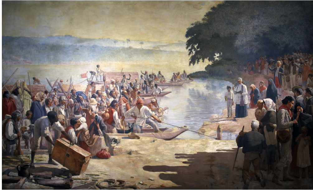
Figure 2 – Jose Ferraz de Almeida Junior. Partida da Monção [Expedition Departure], 1897, oil painting, 390 x 640 cm. Collection of Museu Paulista.