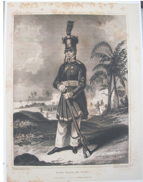
Figure 12 – Augustus Earle. Dona Maria de Jesus. In: GRAHAM, Maria. Journal of a Voyage to Brazil and residence there, during part of the years 1821, 1822, 1823 . London: Longman, Hurst, Rees, Orme, Brown, and Green, Paternoster-Row; J. Murray, Albermarle-street, 1824.