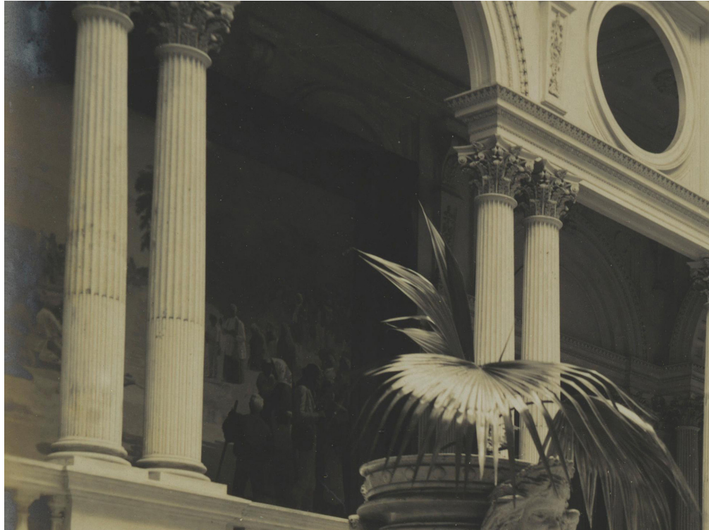
Figure 9b – Photograph referring to the top of the central staircase of Museu do Ipiranga, taken between 1901 and 1905. It is noteworthy the presence of Partida da Monção in detail, hung in the anteroom of the Noble Hall. 72

73. REPORT (1895, p. 15). Emphasis added.