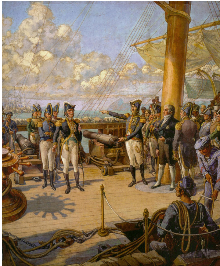
Figure 10 – Oscar Pereira da Silva. O Príncipe D. Pedro e Jorge de Avilez a bordo da Fragata União [Prince D. Pedro and Jorge de Avilez aboard the União Frigate], 1922, oil painting, 310 x 250 cm. Collection of Museu Paulista.

Despite all the director’s efforts in obtaining more information about the fight that took place in Bahia, in 1823, against the Portuguese troops, only one of the four “war episodes” suggested in 1919 was accomplished and painted indeed: A retirada de Jorge de Avilez com sua tropa [The retreat of Jorge de Avilez and his troop] (Figure 10), painted by the artist Oscar Pereira da Silva, born in Rio de Janeiro – all the others remained as mere ideas.