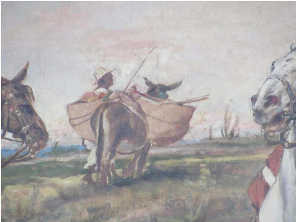
Figure 4 – Barefoot and driving his donkey, the black man, with generic features, follows the path opposite to that in which the main scene takes place.