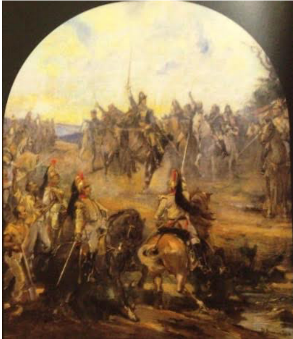
Figure 3 – Pedro Américo de Figueiredo e Melo. Independência ou Morte! [Independence or Death!] (study), [n.d.], oil painting, 59 x 51 cm. Fadel Collection – RJ.