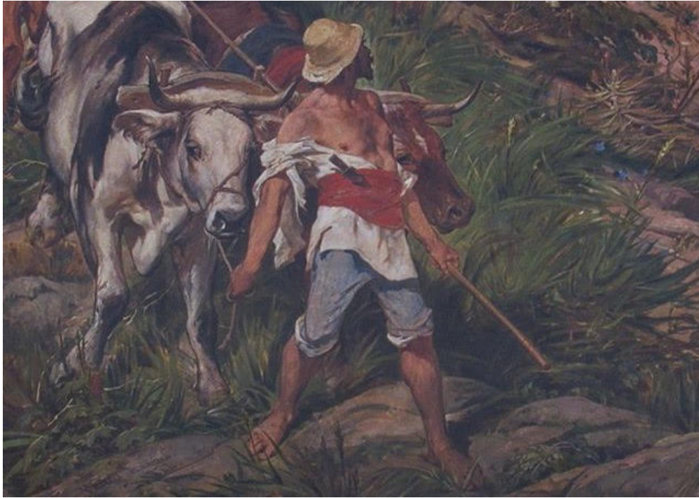
Figure 5 – The white, red, and blue in the hillbilly's clothes.

subject that ignited political debates of the Empire, and the year of 1888 55 – when the painting was completed – urged the discussion once and for all, followed by the intensification of the Republican propaganda, 56 intentionally mistaking the French revolutionary symbology, with the use of colors and gestures, for the scene of Independence and the colors of the United Kingdom of Portugal, Brazil, and Algarve. Just about a month before the Slavery Abolition, the painting was exhibited in Florence with “significant solemnity and in the Noble Presence of Their Imperial Majesties the Emperor and the Empress, as well as other Sovereigns and Princes” 57 , as Américo himself has stated in a letter sent from Italy on April 20, 1888.