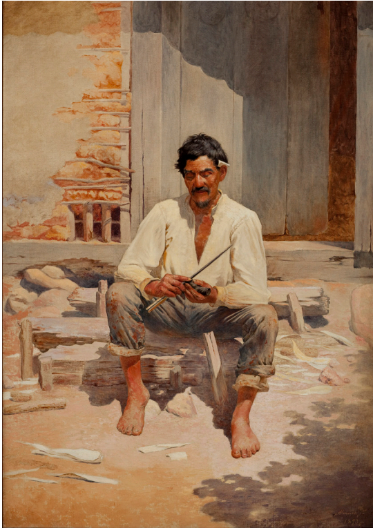
Figure 7 – José Ferraz de Almeida Jr. Caipira picando fumo [Brazilian hillbilly making cigars], 1894, oil painting, 200 x 141 cm. Collection of the Pinacoteca de São Paulo. Transferred from the Museu Paulista, 1905.