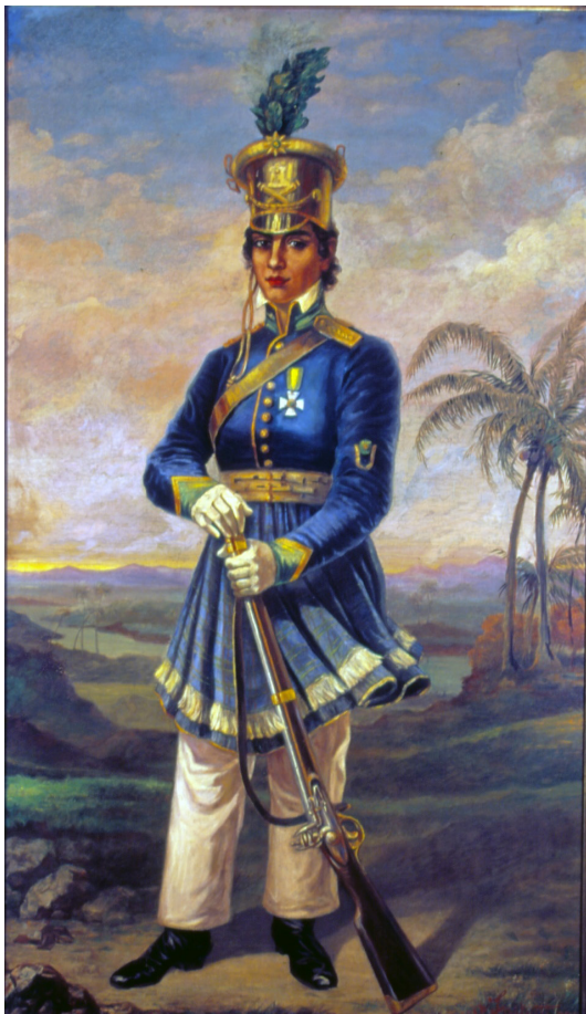
Figure 11 – Domenico Failutti. Maria Quitéria de Jesus, 1920, oil painting, 155 x 253.5 cm. Collection of Museu Paulista.

The other “war episodes” gave way to the portrait of Empress Leopoldina surrounded by her daughters (Figure 13), with the future D. Pedro II, on her lap, also painted by Failutti, and finally, the representation of the Brazilian deputation in the Lisbon Courts, in May 1822 (Figure 14), in which Antônio Carlos Ribeiro de Andrada, brother of José Bonifácio, is the great highlight, due to the painting of Oscar Pereira da Silva. 87