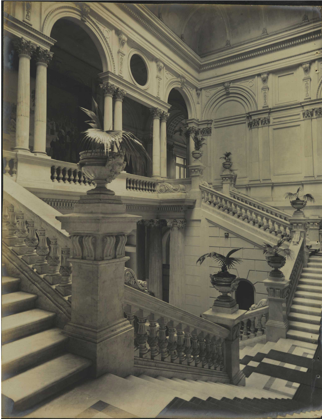
Figure 9a – At the level of the staircase, the visitor would stumble upon Partida da Monção [Expedition Departure] before entering the museum and seeing the Independência ou morte! [Independence or death!] painting.