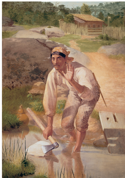
Figure 8 – José Ferraz de Almeida Jr. Amolação interrompida [Interrupted task], 1894, oil painting, 200 x 140 cm. Collection of the Pinacoteca de São Paulo. Transferred from the Museu Paulista, 1905. Reproduction: Isabella Matheus.