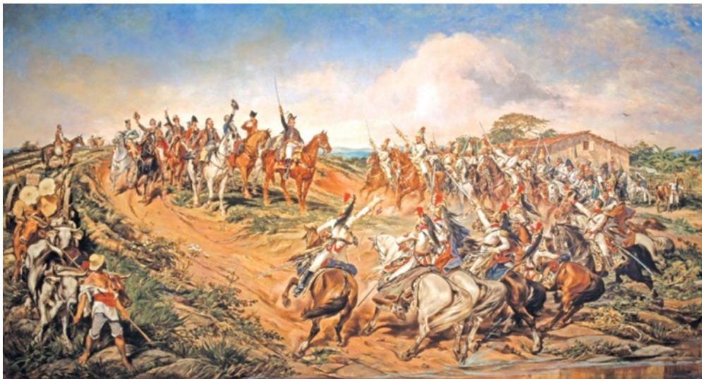
Figure 1 – Pedro Américo de Figueiredo e Melo. Independência ou Morte! [Independence or Death!], 1888, oil painting, 415 x 760 cm. Collection of Museu Paulista.