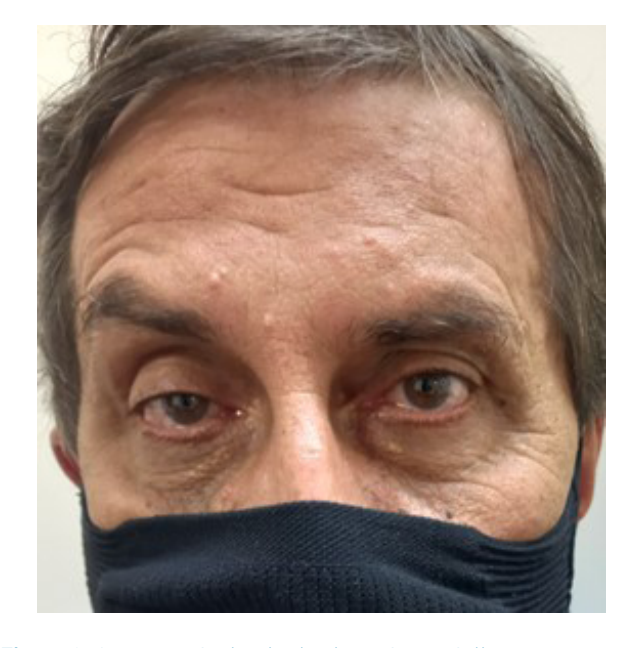
Figure 2. Asymmetrical palpebral ptosis partially compensated by the asymmetric contraction of the frontalis muscle, with uneven elevation of the eyebrows.

Common muscles used for repetitive stimulation are Abductor digiti minimi, Tibialis anterior, upper Trapezius,