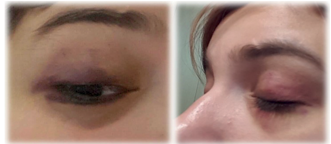
Figure 1. Periorbital ecchymosis after a migraine attack.

The spontaneous periorbital hematoma/ecchymosis in migraine is a rare entity assumed to reflect complex neurovascular changes 1,2 , specifically vasodilation of intracranial and extracerebral blood vessels through the release of vasoactive substances 3 .