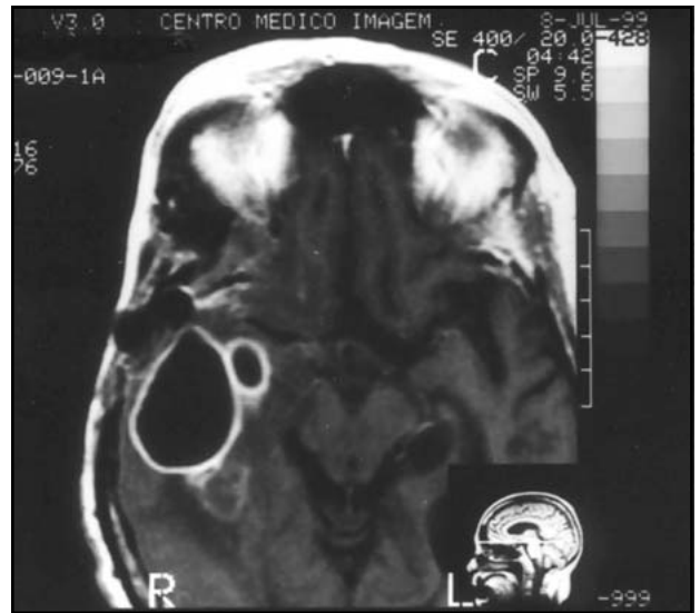
Fig 2. Gadolinium-enhanced T_1 -weighted axial image depicting a right temporal abscess four months after the first surgical procedure.

One month later she developed again signs of systemic infection and the CT scan showed a persistent large right temporal abscess. A new surgical procedure was carried