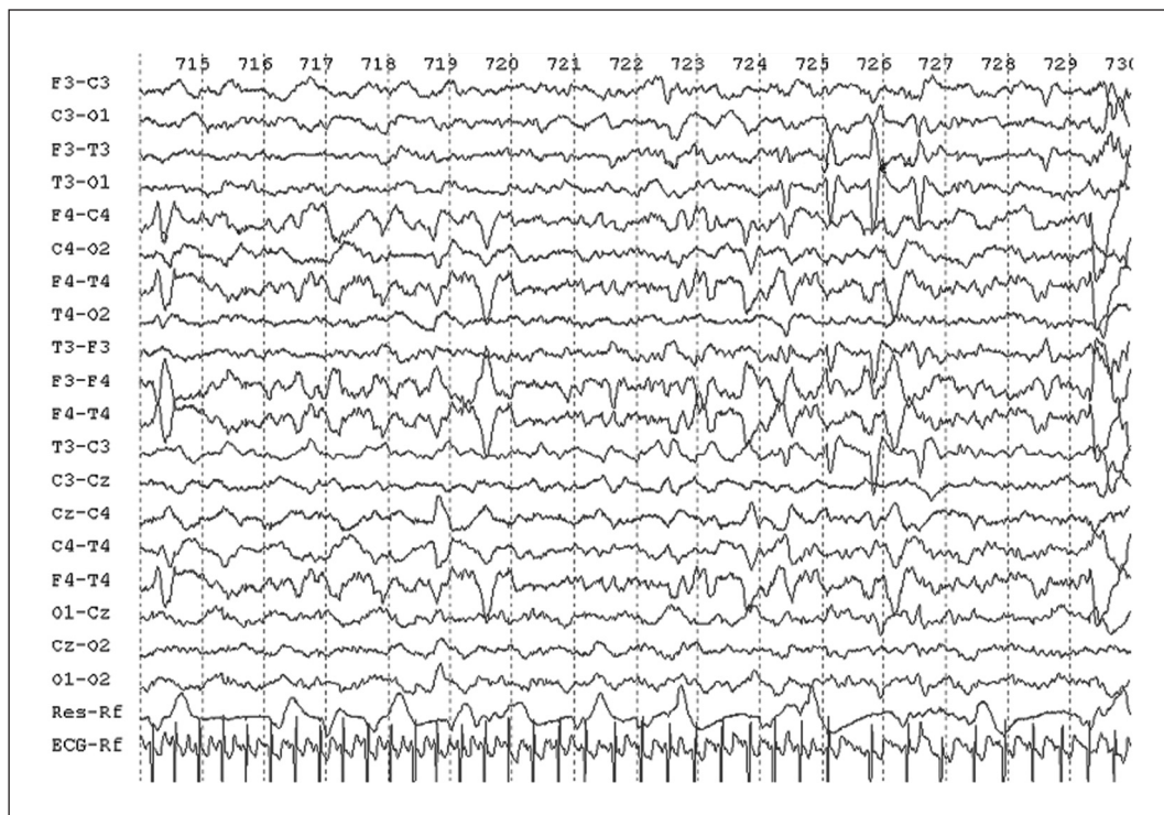
Fig 2. Preterm with gestational age of 30 2 / 7 weeks and conceptional age of 31 weeks. Showed a diffuse slowing EEGN with the BA and PSW temporal and central, as well as paroxysmal discharges in the frontal right. Developed with global hypotonia.