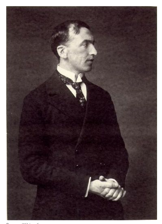
Source: Wikipedia. Figure 1. Hans Gerhardt Creutzfeldt (1920); author unknown