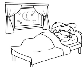
Figure 1. Informative leaflet about fatigue.

Improving your sleep: avoid long naps and avoid napping too late in the day. Set a time to go to bed and a time to get up. Arrange a quiet environment before going to bed.