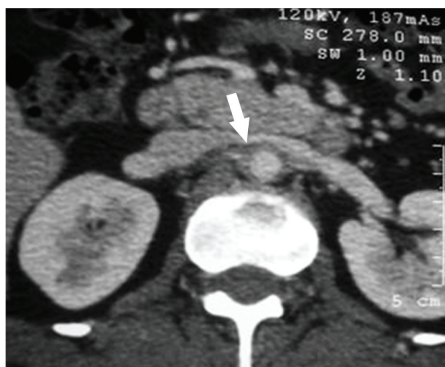
Fig 2. Computerized tomography angiography demonstrates wall thickening of abdominal aorta (arrow) suggesting vasculitis.