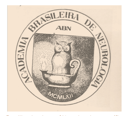
Fig 4. The Brazilian Academy of Neurology logotype (first version).