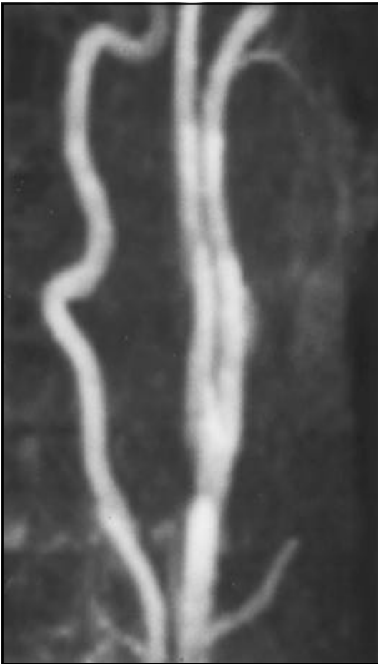
Fig 3. MRA of extra-cranial left internal carotid artery reveals normal lumen 1 year later.

drome ipsilateral to the dissection is present in 14% to 58% of affected patients 4 . Signs of cerebral ischemia are often delayed and will eventually occur in 53% to 90% of the patients 4 . With the turning and extension of the head, ICA is stretched over the lateral articular surface and the pedicle of the axis vertebra, resulting in injury to the vessel, and usually a hemorrhage within the media splits the vessel wall 3 . Subintimal dissections tend to cause narrowing of the arterial lumen, and subadventitial dissections tend to cause arterial dilatation 8 . Dissection often originates 2 cm distal to the bifurcation and extends rostrally a variable distance to the base of the skull 3 . Exposure of the basement membrane leads to platelet aggregation with thrombus formation. Thrombi can be clinically occult, extend and occlude the vessel, or embolize 9,10 .