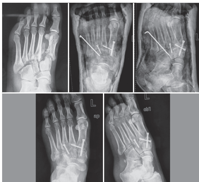
Figure 4. Case 2: Male 40 years old, Myerson IIB type, X-radiograph before operation; X-radiograph shows the fracture-dislocation healed two weeks and six months post-operation.