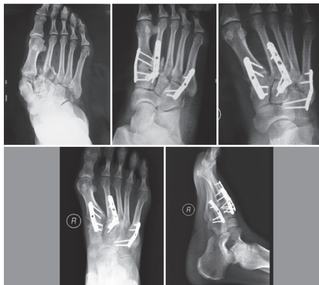
Figure 3. Case 1: Female 38 year as old Myerson I type, X-radiograph before operation; X-radiograph shows the fracture-dislocation healed two weeks and six months post-operation.

Radiographic analysis revealed anatomic reduction in twenty-nine patients and non-anatomic reduction in three patients in group 1 (90.6%, 29/32). Five patients had spontaneous TMT joints fusion verifying from first to all fine rays, and four of the patients did not had any discomfort. There were eight patients