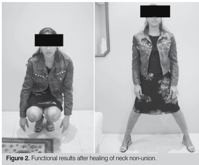
Figure 2. Functional results after healing of neck non-union.

level, delayed surgery, inadequate reduction and poor internal fixation have also been reported.