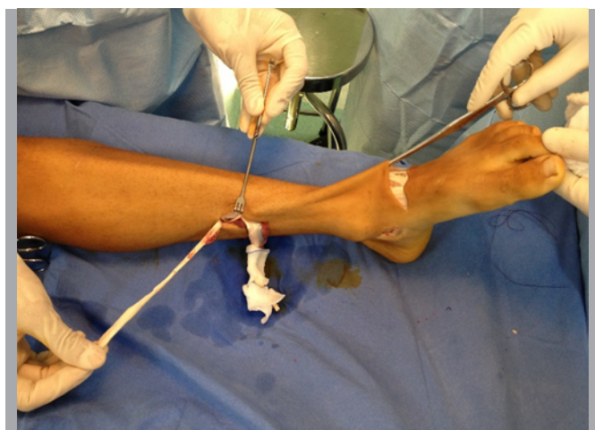
Figure 2. Use of tunneling clamps to subcutaneously transfer the posterior tibial tendon.