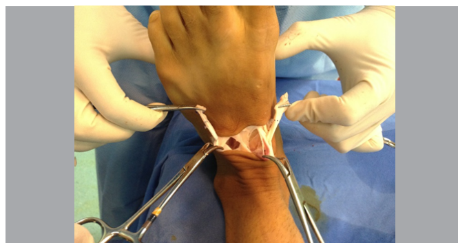
Figure 4. Suture of the lateral tape to the extensor digitorum longus.