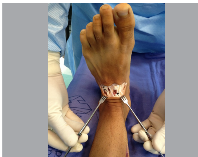
Figure 5. Final aspect.