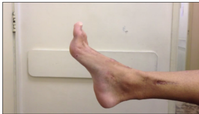
Figure 7. Case 15 performing active plantar flexion.