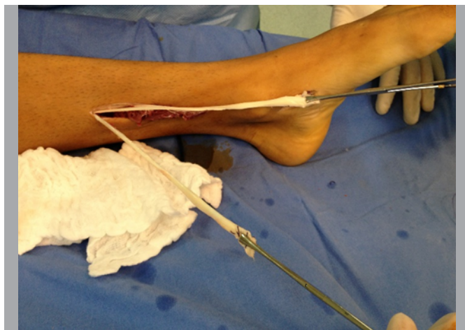
Figure 1. Division of the posterior tibial tendon into medial and lateral tapes.