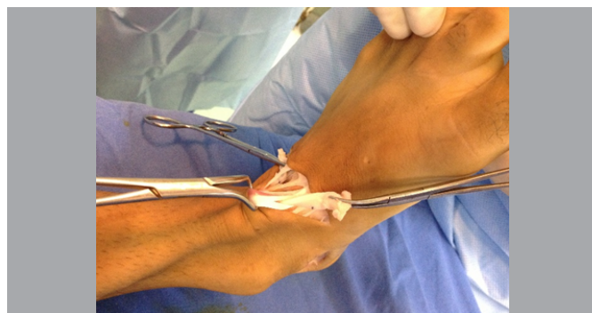
Figure 3. Suture of the medial tape to the extensor hallucis longus tendon.