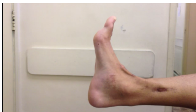
Figure 8. Case 15 performing active dorsiflexion.