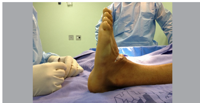
Figure 6. Foot position at the end of the surgery.