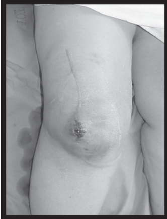
Photograph 2 - Deep acute infection