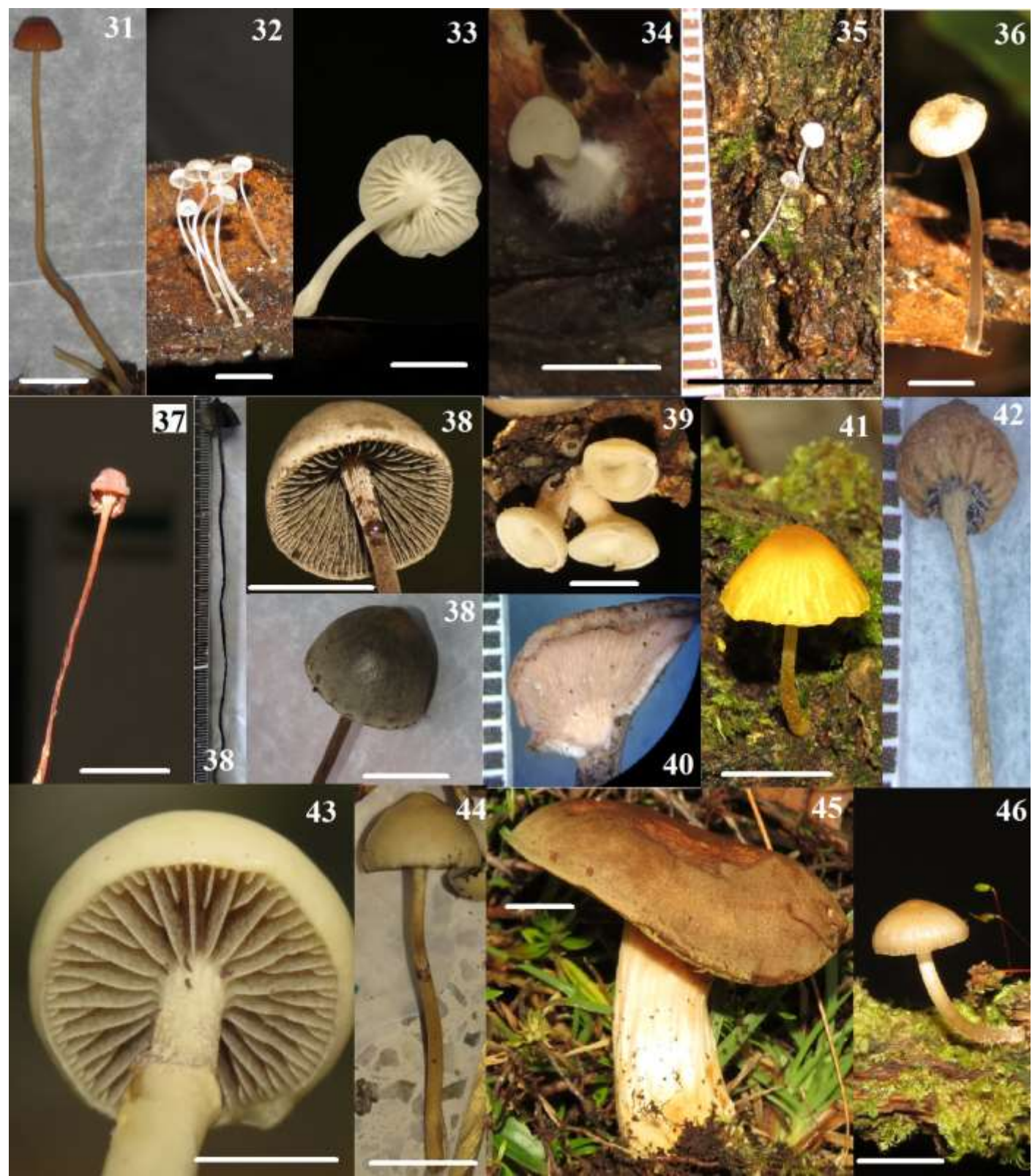
Figure 4. - Species of Agaricales found with numbers according to Table 1.