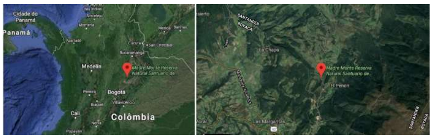
Figure 1. Map of the studied area in Colombia (left – scale = 100 km) and in Arcabuco municipality (right – scale = 5 km).

The species were identified using the usual taxonomic works available to Colombia and South America [2, 3, 5, 9, 11, 13, 16].