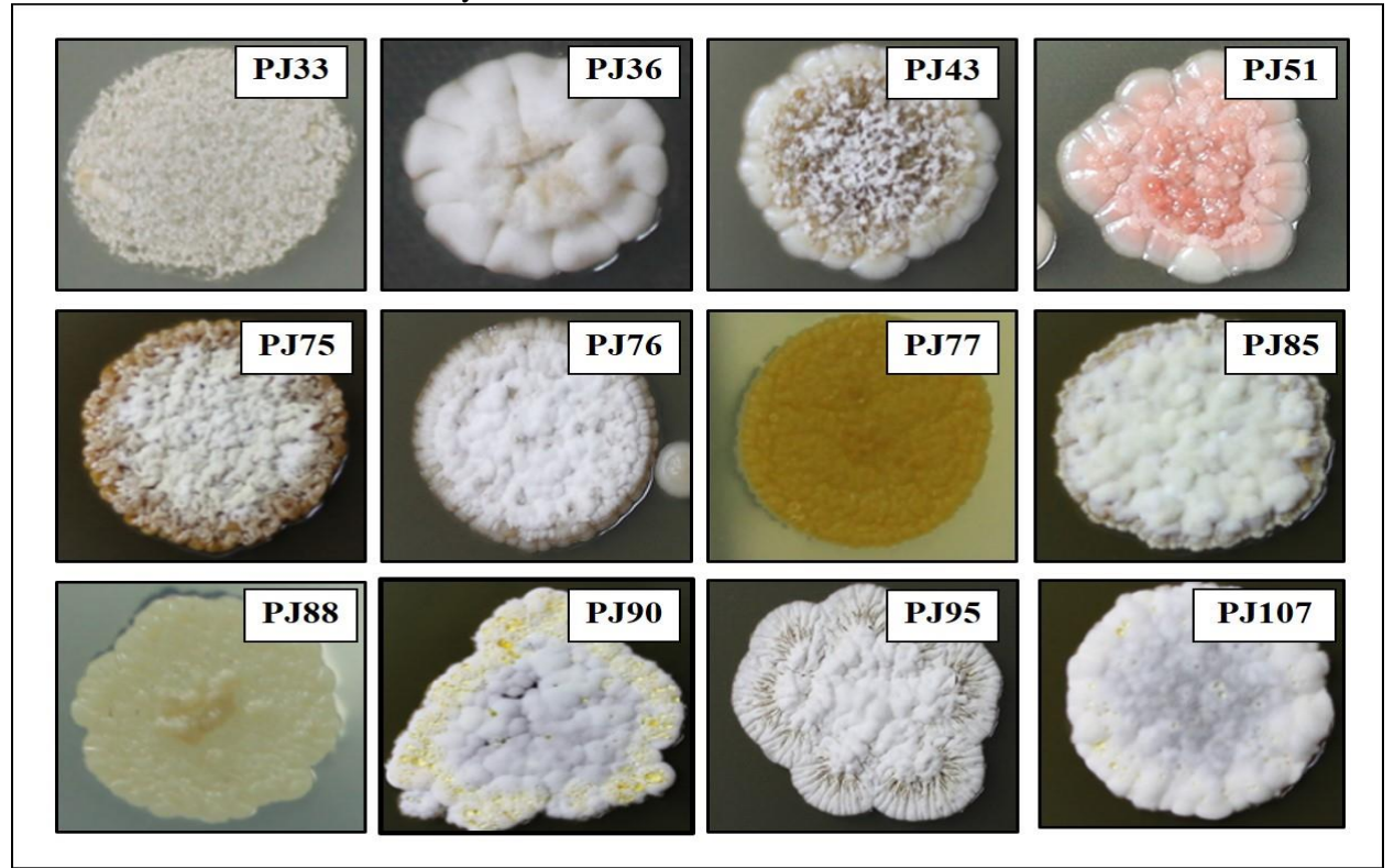
Figure 2 - Colony morphology of twelve antimicrobial-producing soil isolates. The bacterial cell was grown on SCA plate and incubated at 28°C for 5 days.

from twelve isolates named PJ33, PJ36, PJ43, PJ51, PJ75, PJ76, PJ77, PJ85, PJ88, PJ90, PJ95 and PJ107 (Fig. 2).