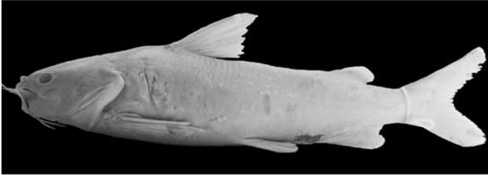
Figure 2 - A partial albino of Genidens barbatus (picture after formalin conservation) with a normal eye color (83.4 cm total length).