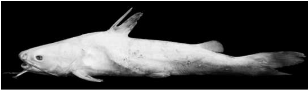
Figure 3 - A partial albino Genidens planifrons (natural conditions) with a normal eye color (62.1 cm total length).

The occurrence of leucistic specimens of Siluriformes in the estuary might have been caused by three factors: (1) random genetic alterations, (2) contamination effects, or (3) genetic alteration due to small population size.