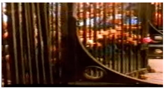
Image 1 – Protesters fighting against Apartheid. Source: Untitled (2005)<sup>25</sup>

It is possible to observe, therefore, the criticism that Dan Halter's work makes by denouncing that some people are freer than others. These initial scenes converge with the utterances that echo from the verses of Rozalla's song, producing a sense effect of a spokesperson in a type of "defense" of the black movement on the streets of South Africa. Thus, the sense of mobilization through / for the union of people is enunciated from verses such as "[...] brother and sister / together we'll make it through " "[...] we are a family that should stand together as one / helping each other instead of just wasting time ." At this point, I reflect with Voloshinov, who teaches us on the essay Slovo v zhizni i slovo v poezii (Discourse in life and discourse in art), from 1926, that: