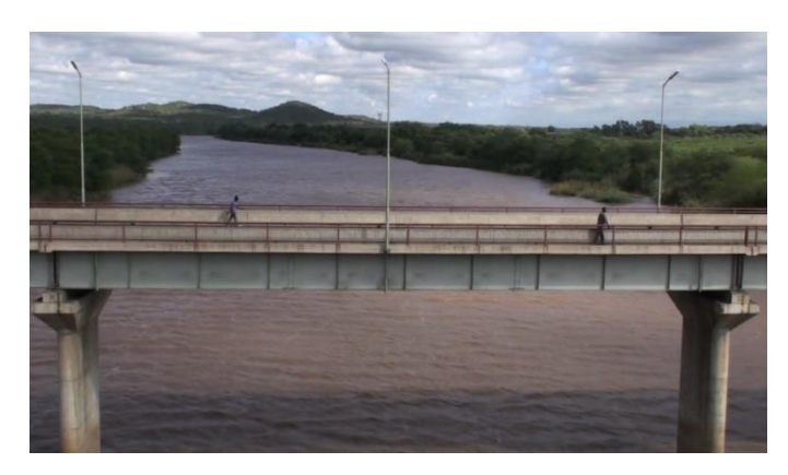
Image 8. Reconstitution of the immigrant's crossing – Beitbridge Moonwalk (2010)

The bridge mentioned by the immigrant is the focus of the image. On the right side of the snapshot, from the beginning of the video (0:09s), there is a represented image of the individual who (through the artist's eyes) would correspond to the immigrant who leaves Zimbabwe towards South Africa in search of a refuge as well as better living conditions.