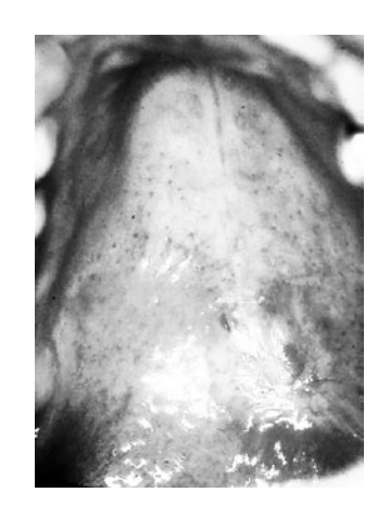
Figure 5. Clinical aspect of the operated area 18 months after surgery. No signs of relapse were seen (Case 2).