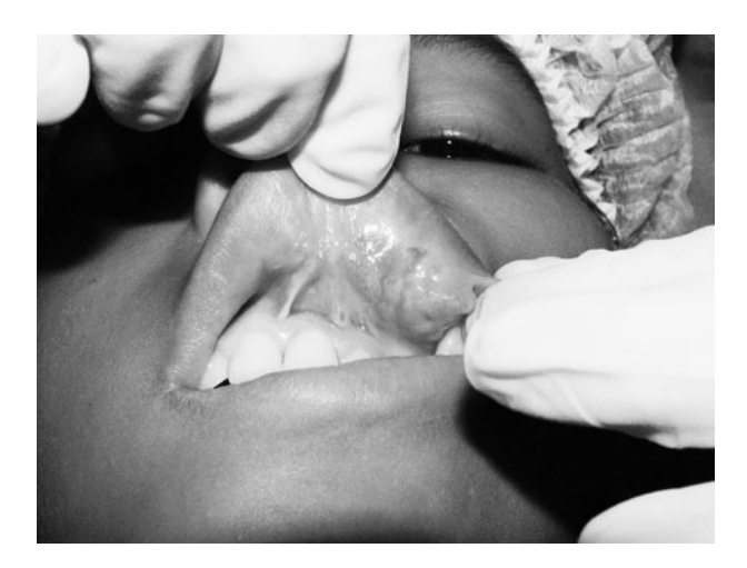
Figure 1. Clinical aspect of the lesion after four conventional surgical procedures (Case 1).