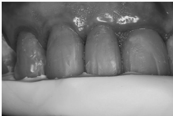
Figure 4. Silicone stop reference used to guide the restoration of each tooth by individual resin layers.