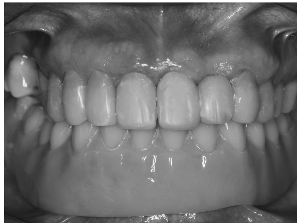
Figure 5. Front view of the full-mouth rehabilitation with direct resin restorations in the maxillary anterior teeth and the mandibular overdenture in position.