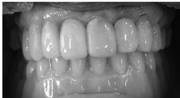
Figure 7. Full-mouth view during the follow-up appointment. No restoration had failed and the mandibular overdenture was stable.